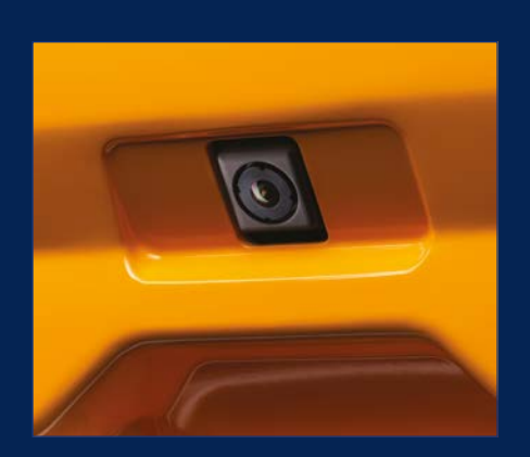
Rear-view camera as standard

Visibility is key while working. That's why the HX65A is equipped with a rear-view camera as standard with the option of a side-view camera.